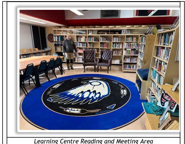
Learning Centre Reading and Meeting Area